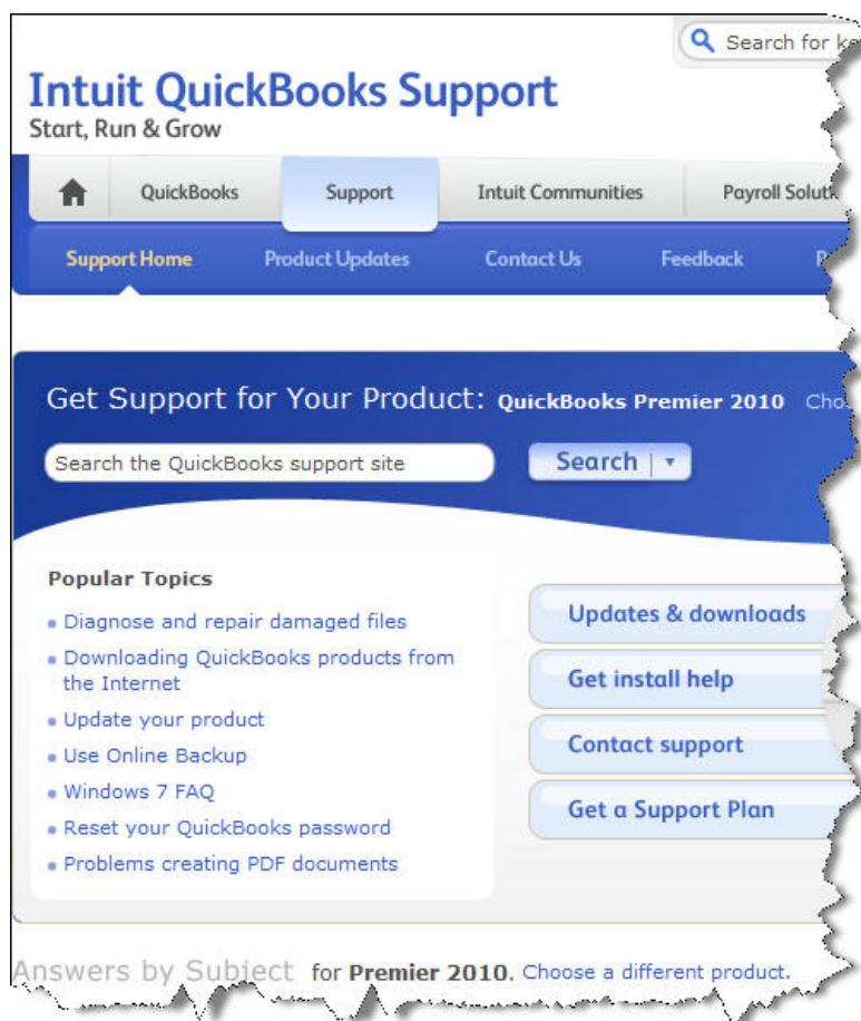
Figure 3: Intuit's online support for QuickBooks can help when you're stumped.

Intuit also hosts an in-depth online support presence. Click Help | Support to get to the main page as shown in Figure 3 . Installation, troubleshooting (with guides to error messages), company and data file management, general procedures—they're all covered there. You can search the support database or browse by topic. These and other resources are available within QuickBooks' embedded browser (you must have Internet access to reach it, as with many other features of the program – click Help | Internet Connection Setup if you're not already set up).