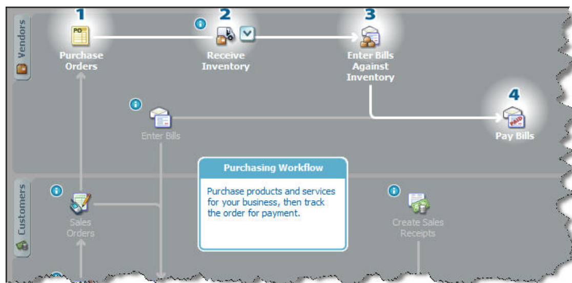
Figure 2: QuickBooks' Coach tool lays out the workflow for primary accounting processes.

As shown in Figure 2 , you'll see a small "i" next to some icons. Click on one, like the one next to Purchase Orders . Related icons light up, and numbers representing their logical order appear next to them. Mouse over one of the icons to read a brief description of the function. When you're done, click Hide Coach Tips to make them disappear.